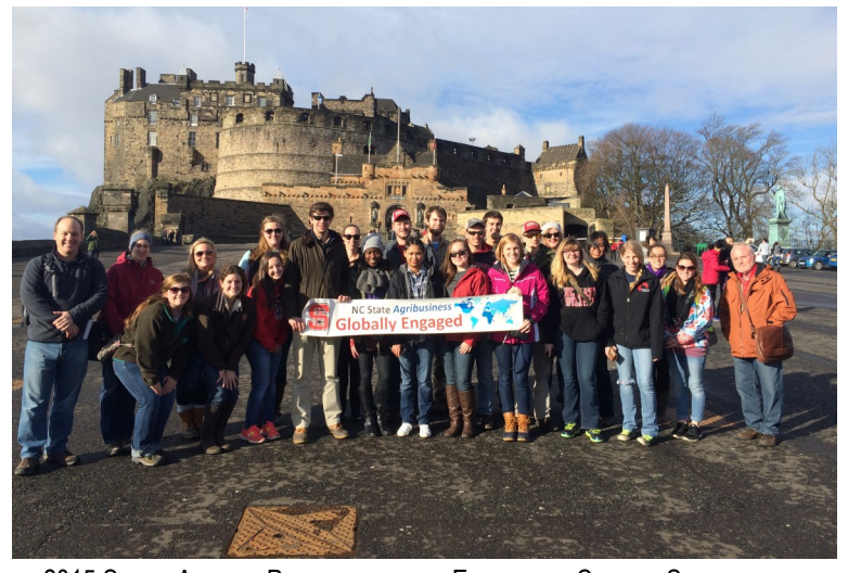
2015 STUDY ABROAD PARTICIPANTS AT EDINBURGH CASTLE, SCOTLAND